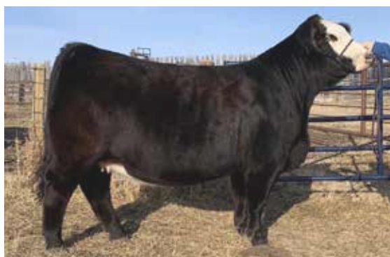
FULL SIB TO LOTS 1, 2 & 3 SOLD TO NORTHERN LIGHT SIMMENTALS, MB