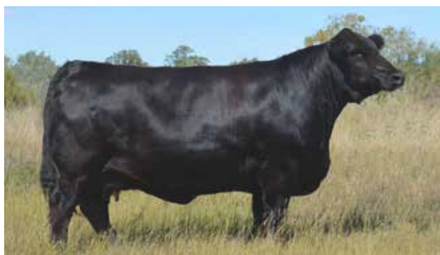
DAM TO LOTS 1, 2 & 3 | GRANDDAM TO LOT 15 LRX MS BLACK 91A "LUCY"

CDI AUTHORITY 77X KOP MS BENGIE 6P TWIN-CHIEF WALKER 21W KOP MS TOUCHDOWN 3X MR NLC UPGRADE U8676 GCF MISS ELSA HARVIE JDF WALLBANGER111X IPU MS. LINER 56U 266Y