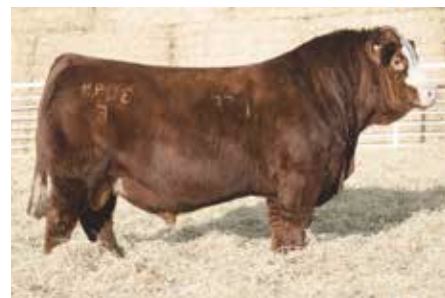
SIRE TO LOT 16 & 17 LFE STRATTON 3094F