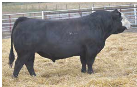
SIRE TO LOT 4 MR SR HIGHLIFE G1609

HOOK'S BEACON 56B WS MISS SUGAR C4 JBS BIG CASINO 336Y MISS SR Y1102 ELLINGSON LEGACY M229 MS NLC MOJO S6119 B TCF/RCC TEMPTATION GJ640 TWIN BRAE PRETTY JOKER