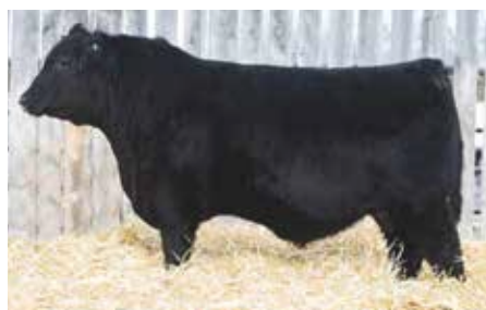
SIRE TO LOTS 7, 8, 9, 10, 11, 12 DFCC 107D HECTOR 63H

241K has been a fan favourite to many folks through the bull pen. He is a moderate bull yet still has an abundance of top and rib shape, tons of hair, and lots of lower quarter. He is definitely a bull to look at when you come for a tour.