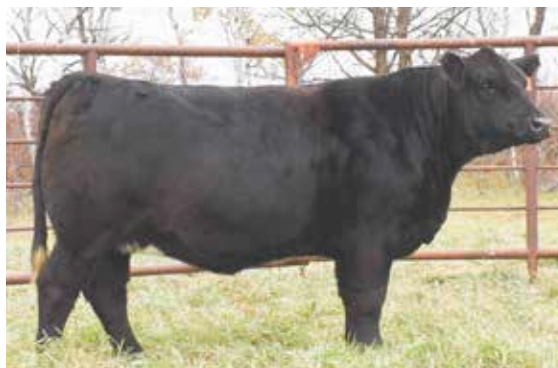
FULL SIB TO LOT 4'S DAM SOLD TO S&S SIMMENTALS, SK