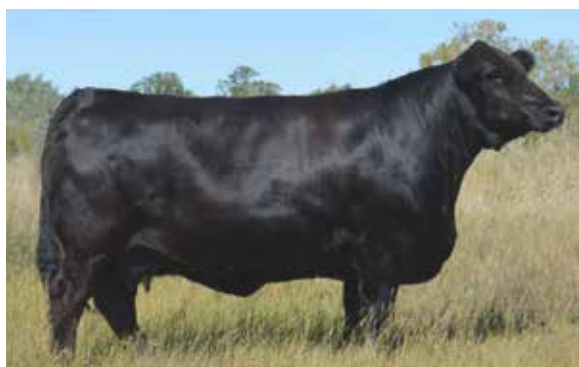
DAM TO LOTS 1, 2 & 3 | GRANDDAM TO LOT 15 LRX MS BLACK 91A "LUCY"

CNS DREAM ON L186 SVF SHEZA BEAUTY L901 G&L BLACKFOOT 716D YC MISS BIK B80 SHS ENTICER P1B JDF PEPSI 61U SPRINGCREEK LINER 56U IPU MS RANCH HAND 74U