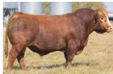
FULL SIB TO LOTS 1, 2, 3 MRK CAPITALIST 35H

Three full brothers this year in the sale, and all 3 cut from the same cloth; peas in a pod. 224K is a bull with an abundance of hip, clean fronted, and gets out and moves like a herd bull should. This bull will sire heavy weight steers and his daughters in the replacement heifer pen will be out of this world.