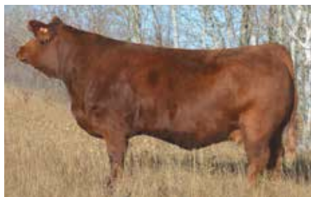
GRAND DAM TO LOT 17 LFE RS AMBER 77C