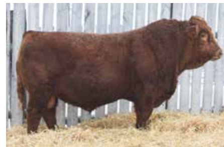
SIRE TO LOT 5 SUNVILLE COMMANDER 17H

230K is the youngest bull in the offering and a bull that keeps changing every day. His dam is a full sib to Lot 1,2 & 3 in this year's sale. She is angular made cow that everyone picks out. 230K is the first bull we have to offer off our walking herd sire, SVS Commander 17H. 230K is an eye catching bull and has been many people's pick when walking through the bull pen. Don't over look this young bull as he is sure to make you some heavy weights in the fall!