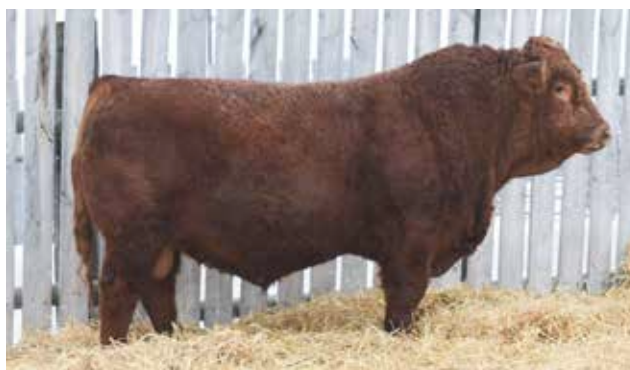
SIRE TO LOT 15 SUNVILLE COMMANDER 17H