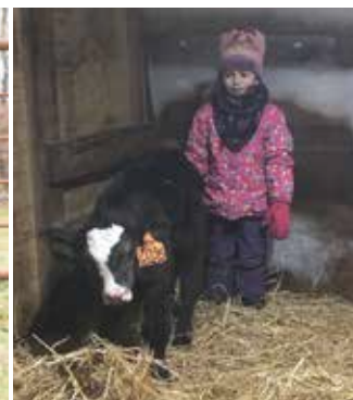
BEXLEY & LOT 4 AT TWO DAYS OLD